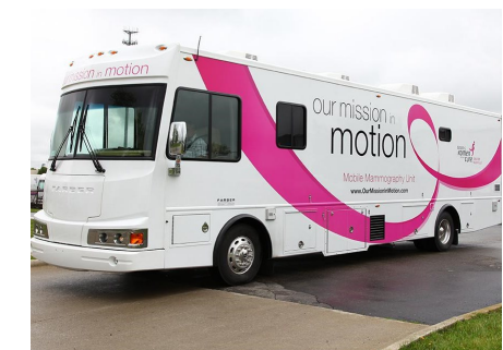
A Mobile Cancer Screening Van