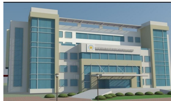
FRONT ELEVATION OF THE HOSPITAL

Please Donate Generously so that the Suffering Farming Families have a chance to beat Cancer.