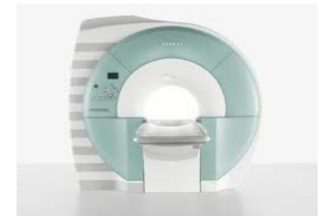
An MRI Scanner