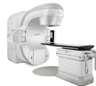
A Linear Accelerator for Radiation Therapy treatment for Cancer patients

EXPANSION PLANS: We hope to add specialties and enhance the number of beds in this hospital to about 400 in the coming years. We also plan to add advanced medical equipment in order to attract patients from the entire state as well as neighboring states like Haryana and Rajasthan.